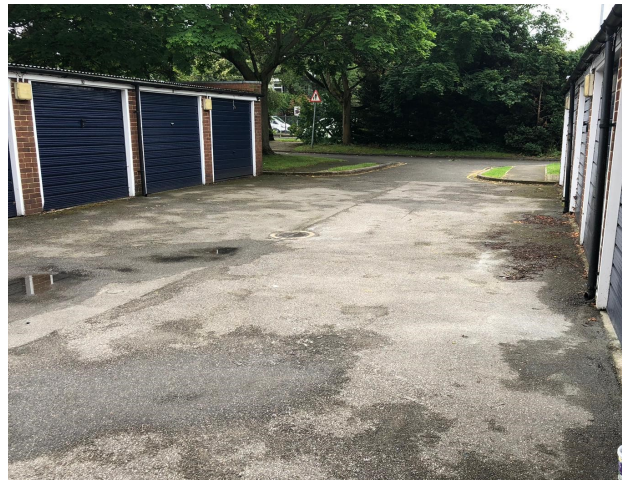
View of the site from the northern boundary