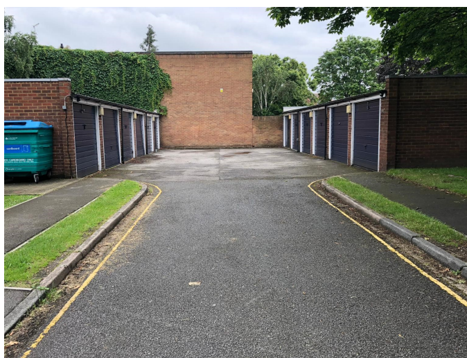
View of the site from Garth Road